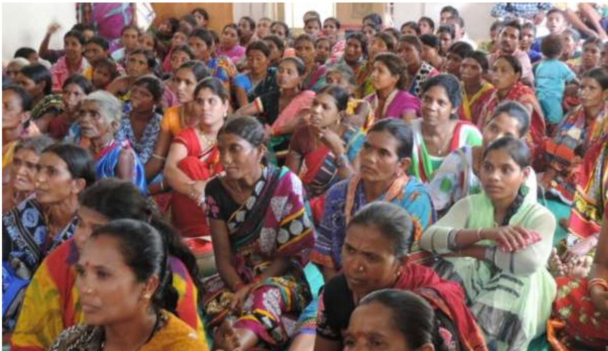
Women Carers Meeting in Progress

WORD emphasis on gender mainstreaming in all its activities and projects in true letter and spirit. The composition of General Body and Executive Body is 100% women and most of the projects are managed by women. 90% of WORD staff comprise of women members. In the projects, it is ensured that the women and children are covered and their vulnerabilities are addressed. Projects related to nutrition, health care, carers, livelihood, panchayat raj etc., emphasis for more participation and decision making by the village women. WORD firmly believes that only if men and women are in an equitable position real development can take place in the village or in the society at large.