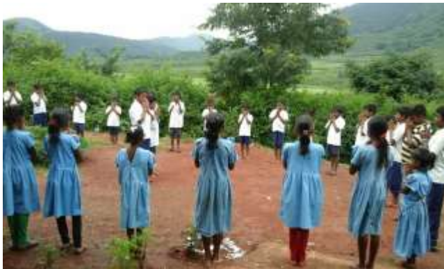
Morning Assembly in a Primary school

The project has been recently started and the outcomes are yet to be ascertained and we are very positive that with the synergized efforts of ICDS, Education department, WORD and the community we can look forward for quality education for children in AWCs and schools.