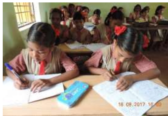
Adarsh Vidyalaya-classroom session